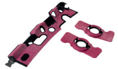
L&L CBS™ reinforcement.

Our CBS™ technologies combine highly engineered heat-activated structural adhesive material with a customized thermoplastic carrier for lightweight but strong structural applications. L&L CBS™ reinforcements can eliminate localized durability problems, such as metal fatigue, by increasing overall stiffness and distributing loads more effectively across the structure. During a crash event, L&L CBS™ technology provides both section integrity and load path management.